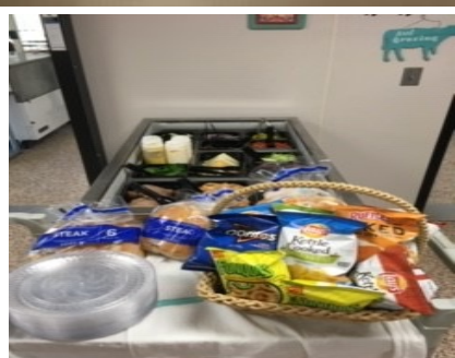
New Ala Carte items